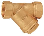
RIV 2500 "Y" Strainer F/F